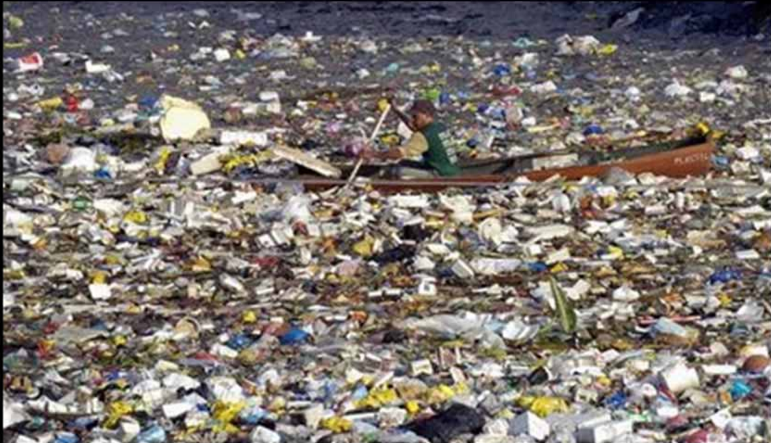
Photo of Pacific Ocean Year 2004